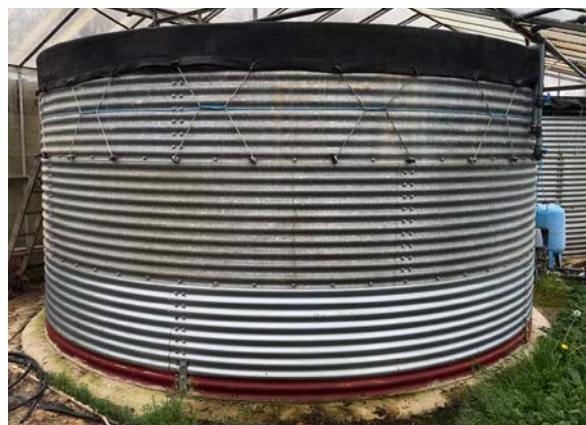
Rainwater storage inside glasshouse at Hankham Organics

Generally speaking a water tank is probably the one 'no brainer' in an installation. They are relatively cheap, easy to install and can be used as the hub into which any water source can be delivered and from which the main pump draws. If you are setting up a new market garden, I recommend that you get a tank and build the rest of the system around it. Things are definitely more complicated without one.