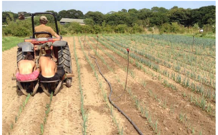
Field sprinklers – 9m radius, 350Lph – with 180° deflector, used to water-in newly planted leeks

Most systems have a type of quick-fit connector which joins the sprinkler unit and tube to the supply pipe. They may be push fit, twist in or a sliding lock type and tend to vary a lot between brands and over time. They do allow for quick dismantling, moving and reassembly but make sure you keep these fittings clean as you move kit around. This is quite tricky so it's worth carrying a cloth to wipe muddy connectors before fitting them back together.