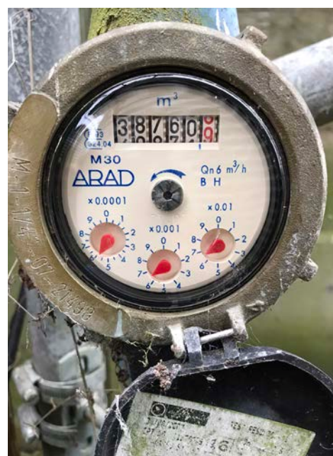
Mains water meter

This has to be compared to the capital and maintenance costs of the alternatives but, depending on where you are located, the cost per m^3 (1000L) in 2022 was between £1.30 - £2. This is still a cost-effective way to maintain high-value crop quality in propagation, salads and protected units. It can become prohibitively expensive when watering field-scale and staple crops.