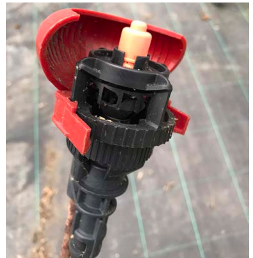
Field sprinkler unit with rod deflector (180 degree spray)