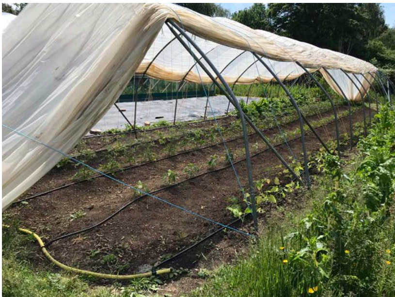
Manifold hose used to connect drip tape

Suction hose is a type that will not close up or kink and inhibit flow when under negative pressure. Used on the suction side of pumps the fittings need to be particularly well sealed to prevent air being drawn in.