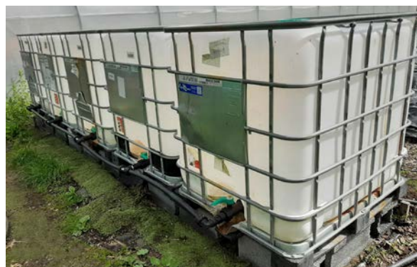
Pallet-mounted IBC's for rainwater storage, collected from a polytunnel