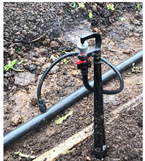
Micro sprinkler and stake placement (60L/ hr). The Montessori Place