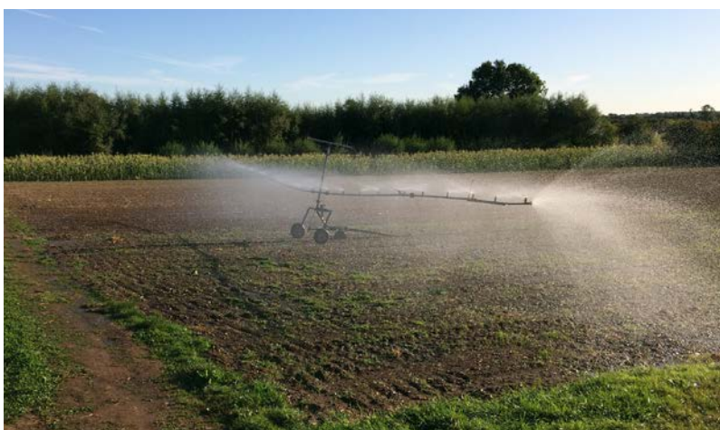
Reel and boom sprayer in action at Tolhurst Organic