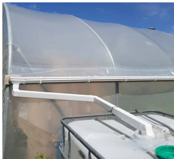
Retro-fitted water harvesting from polytunnel

Fresh rainwater is the best for your plants and will offer a very low risk of contamination, assuming the collection surface is reasonably clean. Storage is clearly important as (with the exception of protected/greenhouse spaces) the need to irrigate is coupled with lack of rain. If there is inadequate storage, rainwater collection can be a fairly pointless exercise for larger growing areas.