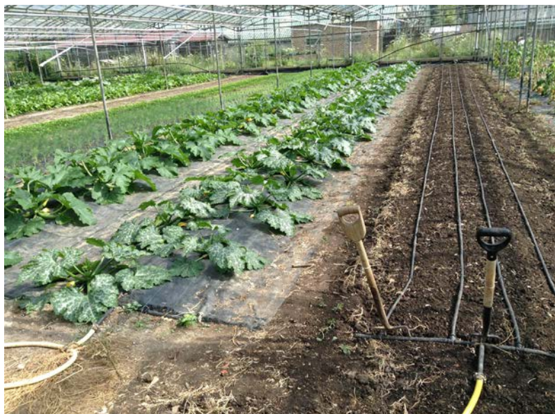
Drip line set-up to water under sheet mulch

The benefits of using drip irrigation for water efficiency cannot be overstated. Claims of 70% reduction in water use compared to sprinklers seem dramatic but they're not unrealistic when you consider that the water goes directly to crop roots and never sits on the surface, subject to evaporation. On the down side, the pipes can interfere with weeding and cultivation operations and once set up, aren't usually moved until the crop is pulled out. This means it's not so practical for short term crops but worth considering for perennials and crops grown through mulches or ground cover, or for protected crops that need constant watering.