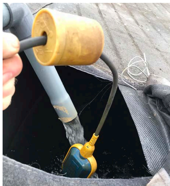
Float switch used to automate tank filling from rainwater storage, Hankham Organics

www.metoffice.gov.uk/research/climate/maps-and-data/historic-station-data