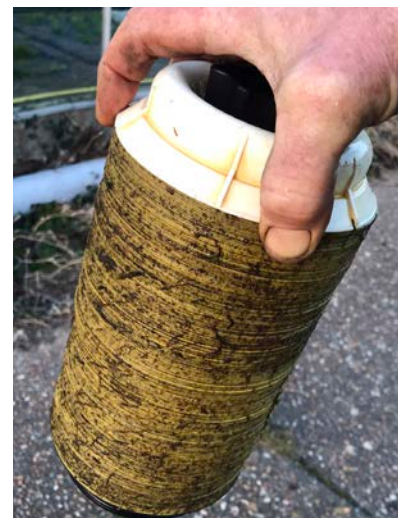
Disc filter overdue for a clean