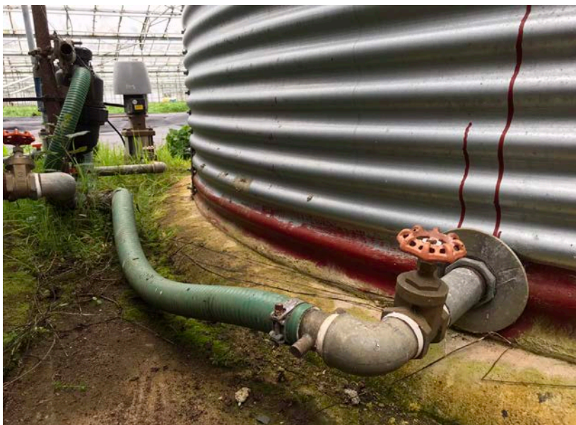
Green suction hose from tank outlet via disc filter to pump