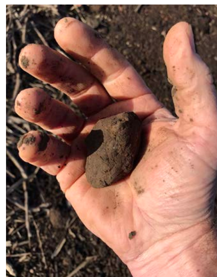
Soil ball (clay) pressed in the palm to estimate moisture

There is a point between 5% and 25% soil moisture known as the wilting point; this will vary between different soils and if you know your soil type, it can be estimated. The amount of water between the wilting point and field capacity is known as the 'available water' and this is the bit we need to keep happy.