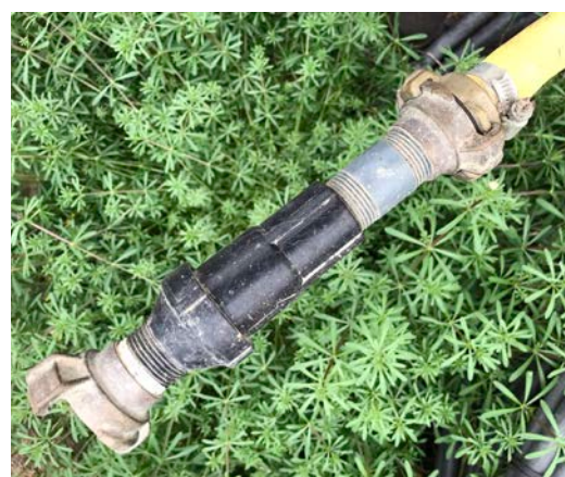
In-Line pressure reducing/restricting valve