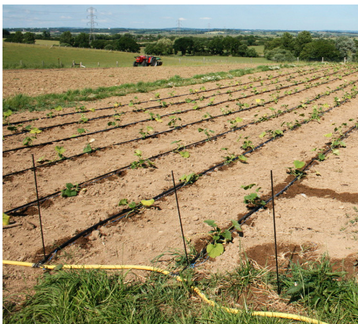
Drip tape to squash, not normally required but this was an exceptionally dry season.

Soaker hose or leaky pipe is made from a perforated, flexible, rubber material that is great for smaller areas and around perennial crops. It has a reputation for uneven watering which is probably due to the lack of pressure compensation along long lengths or on slopes. If set up correctly with a pressure regulator (0.5 bar) and short (<25m) lengths following contours, it should work fine.