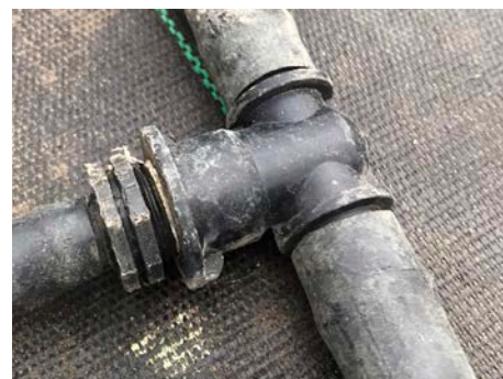
19mm LDPE Manifold to barbed Tee with 1/2" threaded branch to a director for drip line connection