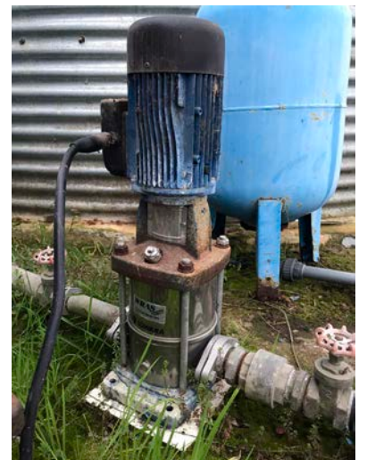
Vintage Vertical Pump with galvanised steel pipework, gate valves and brass NRV. Expansion vessel in the background.