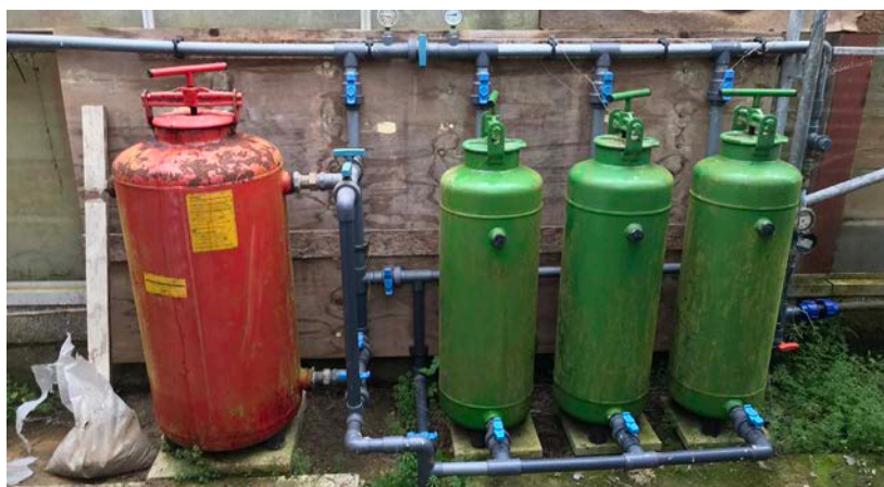
Sand filter installation for stored collected rainwater filtration, green filters are in paralel followed by the red filter which contains sand and ground biochar.

Specify your storage tank to maximise capture of summer rainfall events rather than attempting to store winter rains into the summer. Storing large quantities of stagnant water in tanks during the summer risks encouraging algae so a naturalised reservoir is better for long-term storage (see above 'Water Tanks').