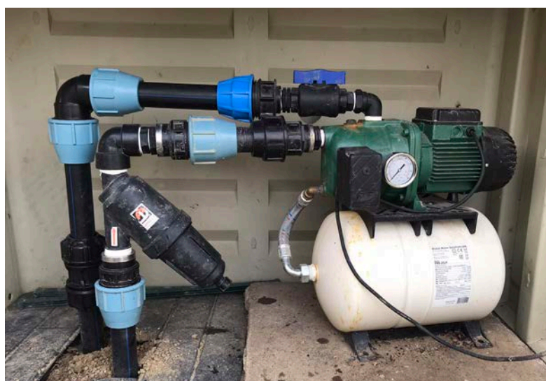
Horizontal pump with expansion vessel , intake filter and automatic pressure switch set-up in a plastic garden storage box. The Montessori Place.

Pressure is maintained in the system within a selected range. A wide range will mean the system cycles between a max and min pressure and can be annoying when using application kit. A narrow range keeps the pressure more consistent but also means the pump is switching on and off more frequently. It's worth soundproofing the pump shed if it is positioned near working areas, this also doubles as freeze protection .