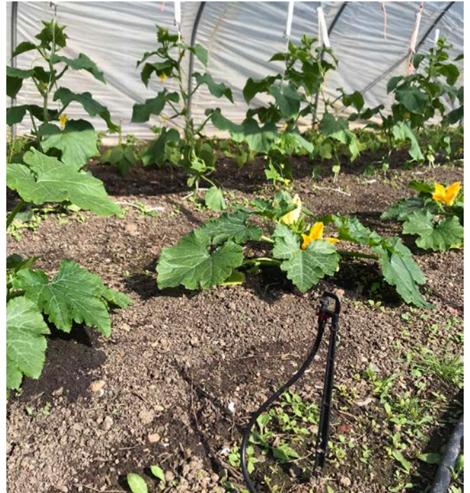
Micro-sprinkler establishing protected crops before drip line is set up

Drip irrigation can be built into manifolded sets to cover beds or supply a series of rows. There are various ways of doing this. Some systems have their own header pipe designs but using ½" threaded connectors to join the drip pipe end connector to a series of T connectors along a 19mm LDPE pipe can create a decent reusable manifold, sized to your bed system. Lastly all pipes can move around with the expansion and contraction caused by hot sun then cold water. This is more of an issue with dripper pipe so it is worth making some hoops out of wire to pin them down. They can be kept slightly taut by securing the manifold then tying back the opposite end to a stake with expandable elastic or a rubber tie.