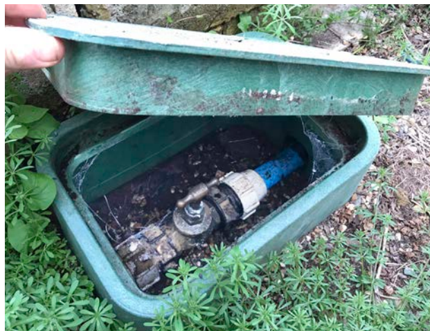
Incoming mains supply stop cock in a ground access box, Hankham Organics