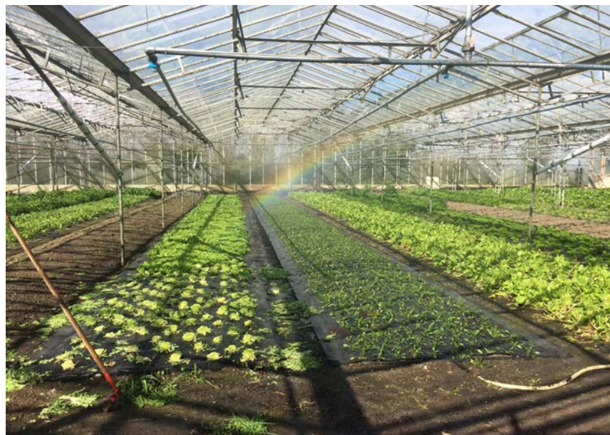
Overhead and drip irrigation both have their uses in the greenhouse. Hankham Organics

What is the maximum volume of water (flow) and pressure requirement your system will demand? This will be based on the area to be irrigated, distance/height water needs to travel and the type of application equipment.