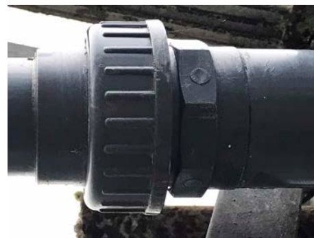
PVC 50mm union

Tubing is usually 32, 40 or 50mm. Fittings can be purchased in imperial measurements if repairing an older system; but use metric for all new set-ups. Full lengths can be run end to end as they have an incorporated socket. Otherwise connectors will need to be fitted with sockets, elbows and tees used to route the pipes. Unions (which join at a sealed flat surface rather than insert) can be used either side of equipment to allow easy removal, such as for filters. They are also useful when adding or repairing sections if the pipework cannot be easily moved.