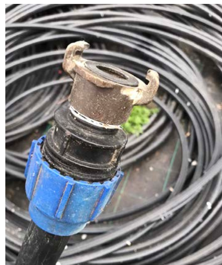
Brass quick connector threaded to poly compression fitting on 32mm LDPE pipe.