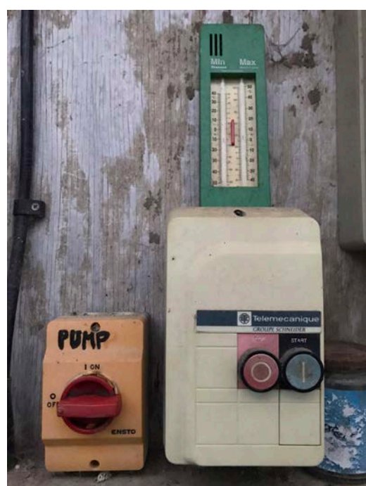
Pump DOL (Direct On-Line) starter and overcurrent device