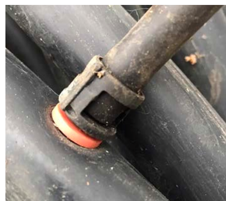
Quick fit connector into 32mm MDPE .